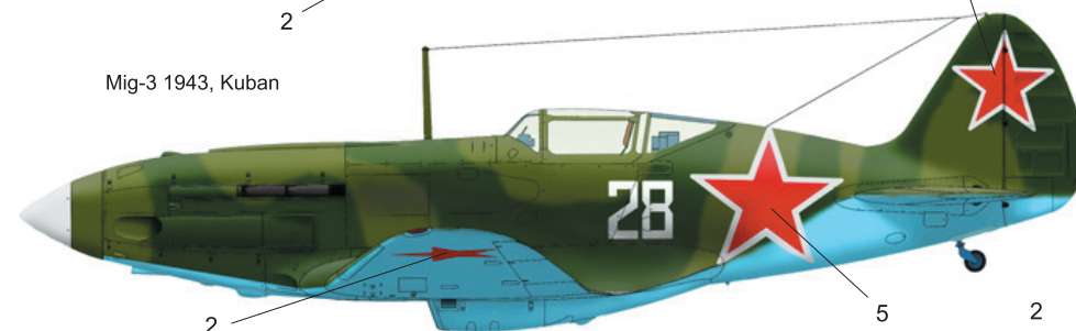
These images show a line of MiG-3s and P-40s of 7 IAP VVS ChF (Black Sea Fleet) in Kuban, 1943.