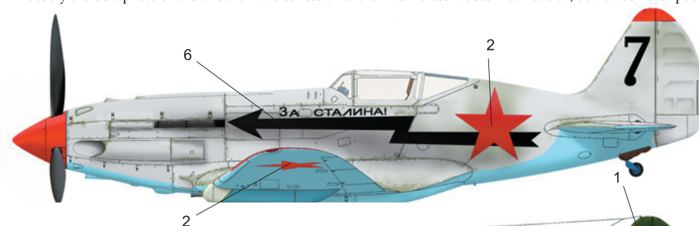
Mig-3 1943, Kuban